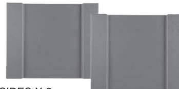
SIDES X 2